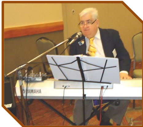
At Grand Lodge