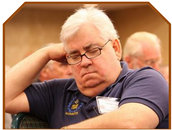
GL session can be a little boring