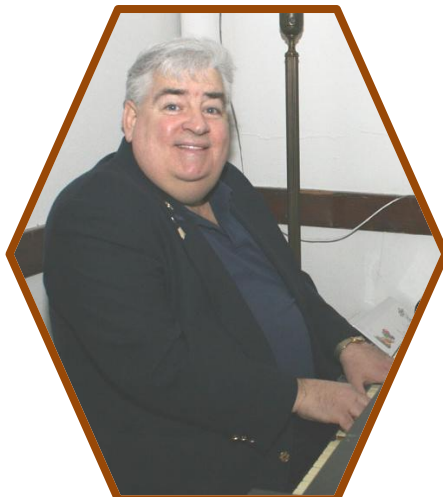
At the keyboard