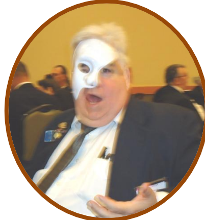
A phantom at Grand Lodge 2010