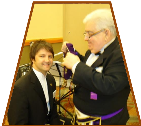
Symbolically passes the Grand Musician Jewel