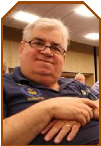
At Grand Lodge 2009