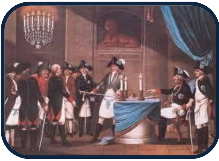
An 18 th or 19 th Century Lodge meeting, most likely French